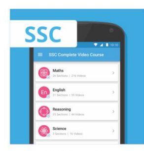
SSC Complete Video Course