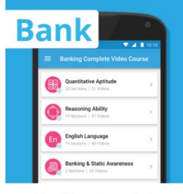
Banking Complete Video Course