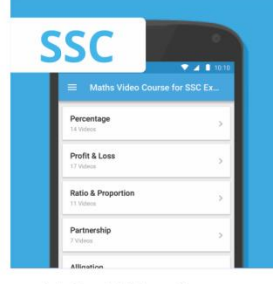
Maths Video Course for SSC Exams