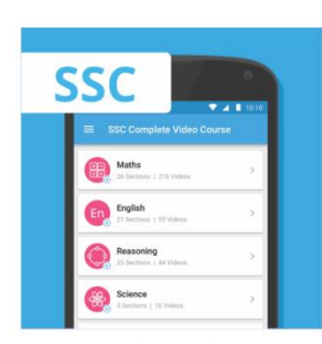
SSC Complete Video Course