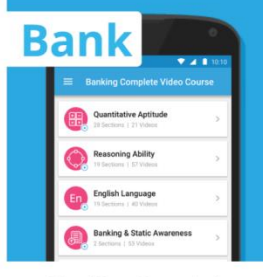
Banking Complete Video Course