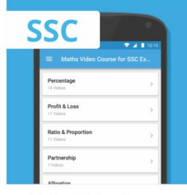
Maths Video Course for SSC Exams